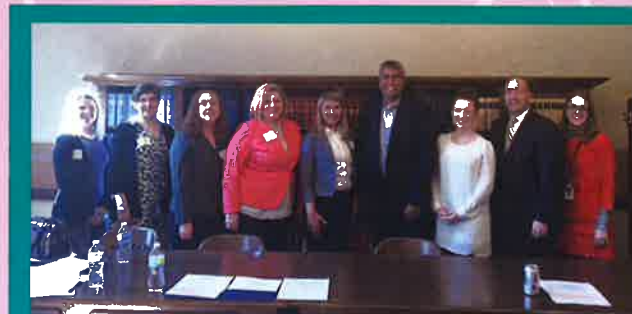
SPAC Capitol Day 2015

One important way that you can become involved in supporting these efforts is by attending the Michigan State Council of Junior Leagues' "Day at the Capitol" on March 2, 2016. At this event you will have the chance to share our goals with legislators and ask them for their support. Our League is in the Capitol City, and it's a big goal of ours to have a strong presence at this year's event.