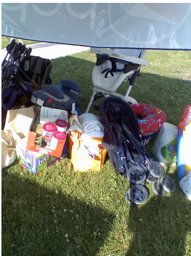
Donated items from Junior League Members

Pregnancy Services is a local organization that provides a variety of free services including counseling, pregnancy and ultrasound testing. They also donate over 15,000 baby items (clothing, diapers, formula), 1,200 pieces of equipment (car seats, high chairs, playpens) and 70 cribs per year to women in need. The organization has been serving our community since 1977.