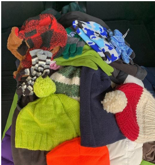
Hats and gloves donated to the Homeless Angels Outreach Program

During December's annual Holiday Open House, members donated two boxes of Tuna Helper, four cans of tuna, one large can of yams, ingredients for green bean casseroles (two large cans green beans, two cans cream of mushroom soup, two jars fried onions), four cans of soup, Hormel chili, three cans of pasta, five boxes of mac and cheese, and $32 collected (used to purchase four bottles body wash and 1,200 baby wipes) to City Rescue Mission, a Lansing organization that provides food, shelter and hope to women, children and men in Michigan's capital area.