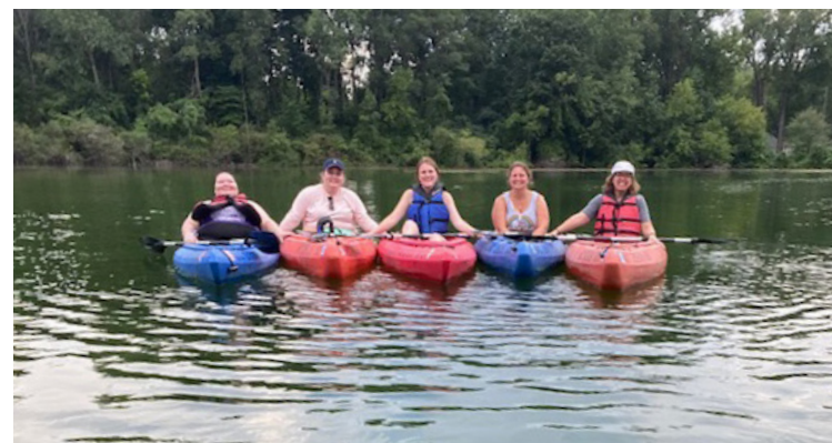
A kayaking new member recruitment event was hosted this fall.