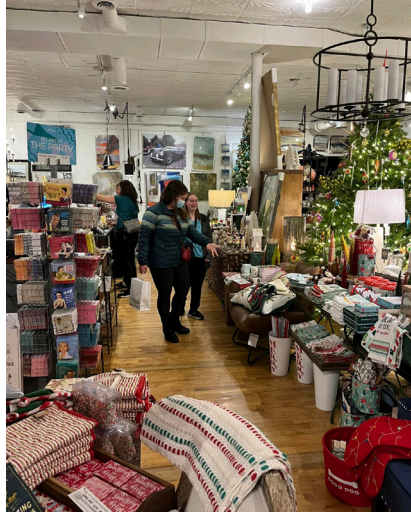
Sip N' Shop at Bradly's Home and Garden