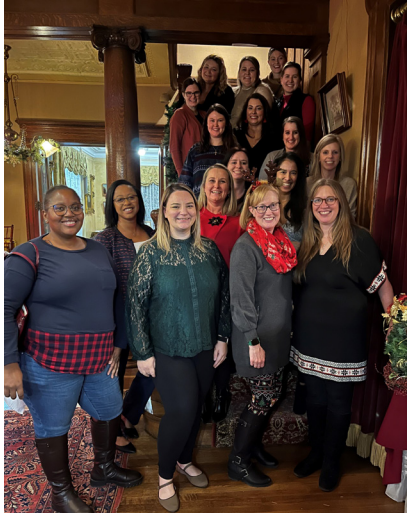
Annual Cookie Exchange at the Turner Dodge House

Rolling recruitment continues to be in full force with new members joining throughout the year. New Member Committee chairs have hosted coffee hours and socials for those interested in the Junior League of Lansing. Members sipped and shopped at Bradly's Home and Garden on November 9, and gathered on December 13 for the annual Cookie Exchange at the Turner-Dodge House in Old Town, Lansing.