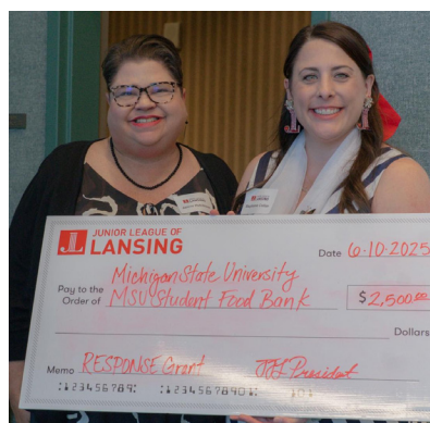
MSU Student Food Bank Grant