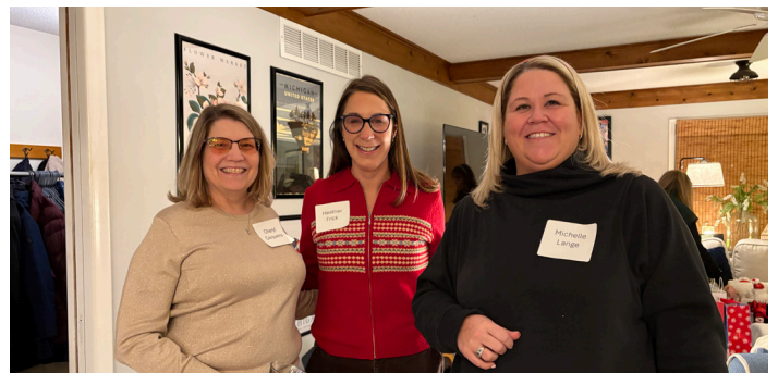
Sustainers at 2025 Holiday Open House