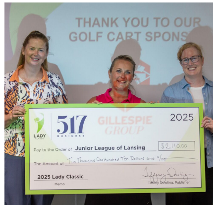
Lady Classic Caddie Auction Proceeds to JLL