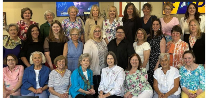
Sustainer and Past President Spring Luncheon