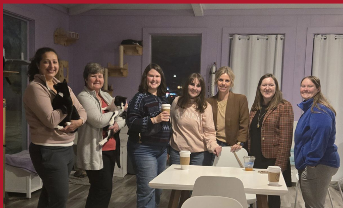
JLL Members Social Event at Constellation Cat Cafe