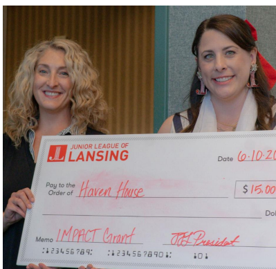
Haven House Grant