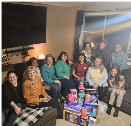
Charcuterie for a Cause Recruitment