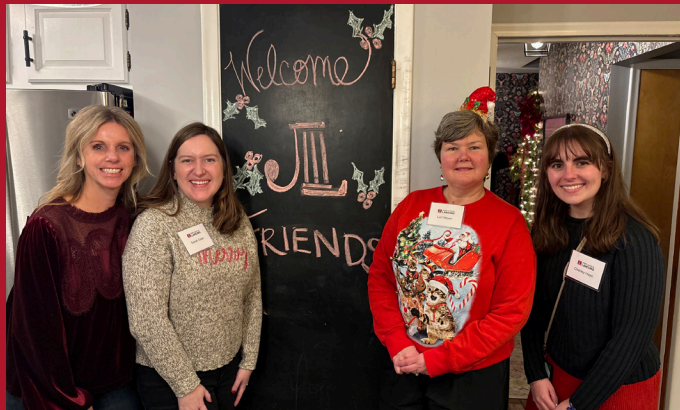
Holiday Open House Planning Committee

Much more to come in the New Year from our Member Events team: Barre, Pilates, Member Brunches, and more.