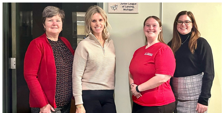
JLL Members at Catholic Charities Event