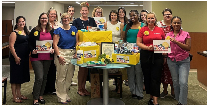
Find the Good Day 2025

The winner of this year's Community Fund Grant is the Capital Area Housing Partnership. Capital Area Housing Partnership is a nonprofit organization based in Lansing, Michigan that focuses on developing strong, diverse neighborhoods throughout the region. It provides affordable housing, supports homeownership opportunities, and offers financial counseling services. CAHP's work includes building and rehabilitating homes, delivering housing education, offering down payment assistance, and helping prevent homelessness.