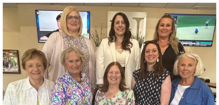
Past and Current JLL Presidents