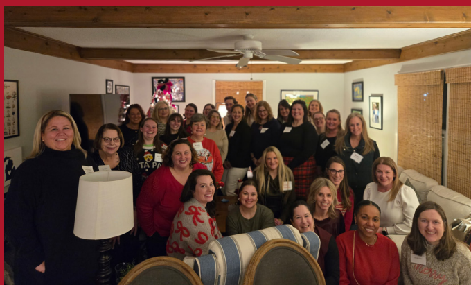
Holiday Open House