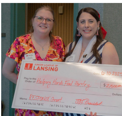
Helping Hands Food Pantry Grant