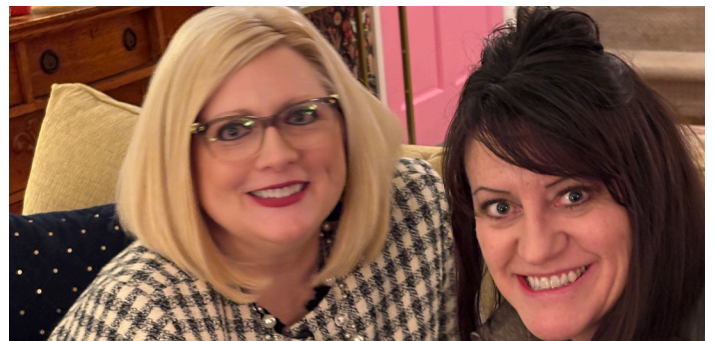
Sustainers at 2025 Holiday Open House