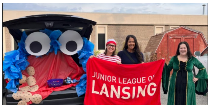
Trunk or Treat 2025