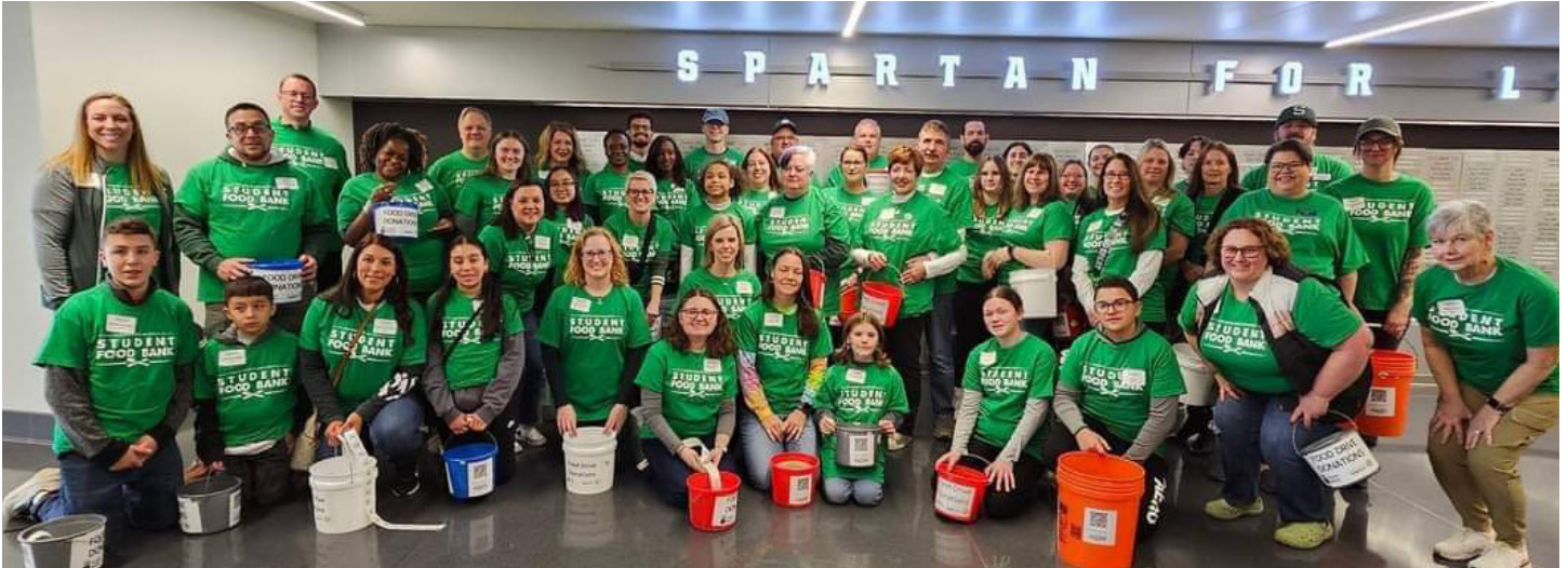
MSU Student Food Bank Drive

Here's to another year of Junior League of Lansing members serving our community through volunteering, grants, and advocacy.