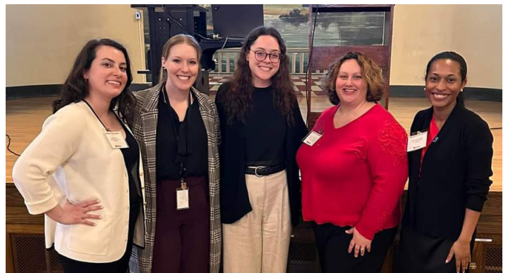
MSC SPAC Day at the Capitol

Thank you to the Volunteer and Advocacy Committee members for your dedication and service to making our community a better place.