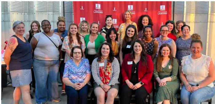
Attendees at Find the Good Day