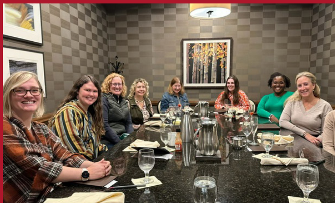
Brunch at Bordeaux