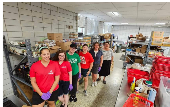
Volunteers at the MSU Food Bank