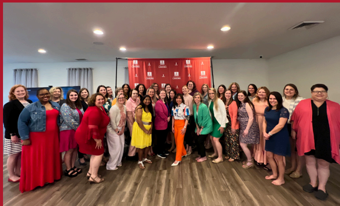
2024 Year-End Celebration