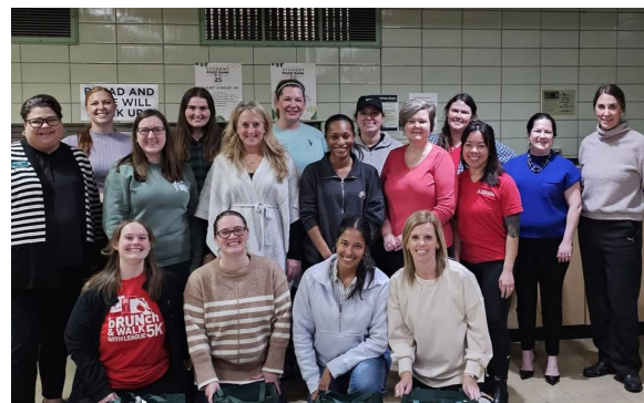
Packing "thankful bags" at the MSU Food Bank