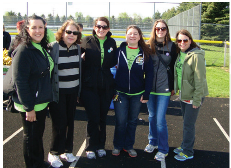
Girls on the Run 5K DIAD Event