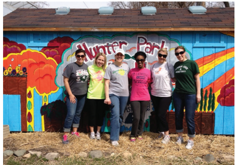
Allen Neighborhood Project DIAD Event

Looking forward to seeing everyone at the September 2014 GMM!